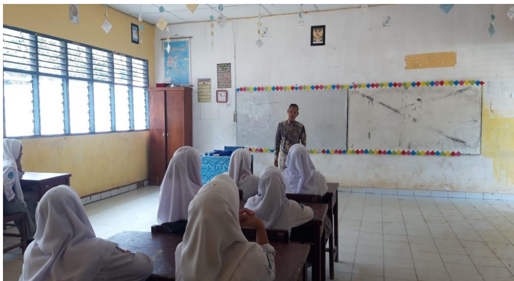
Figure 3 Extension process