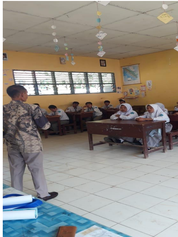
Figure 2 Question and answer process