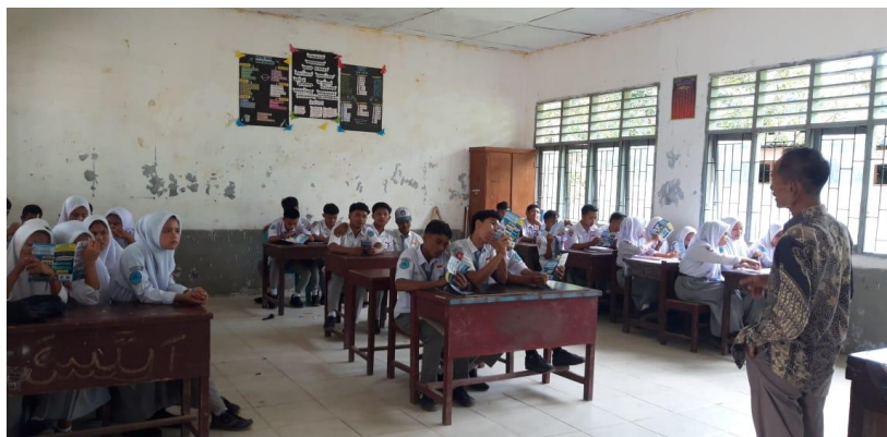
Picture 1 Opening of the talk